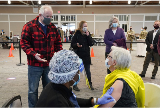
Minnesota Gov. Tim Walz at a vaccination site in the state last month. His proposed income-tax hikes would take effect for the 2021 tax year.