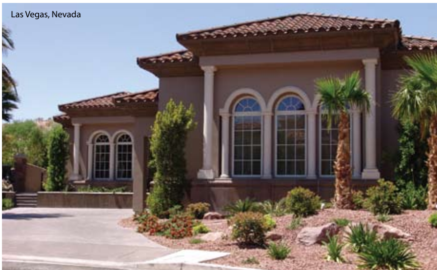
Las Vegas, Nevada

For a more covert investment location, look to Mesquite, Nevada, which is located about 120 km