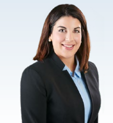
Brittney M. Miller Family Law