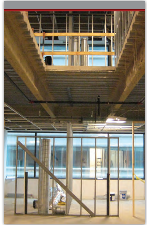
Future Location of Stairway Connecting Floors 11 and 12