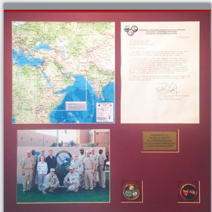
Outstanding Services as a Civilian Employer Award